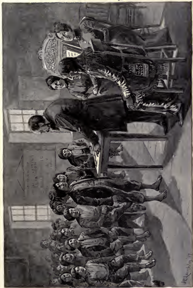
SINGING FOR JACK-KNIVES.